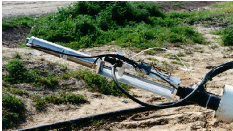
Close-up of the Side Slope Anchor Pump 102A

The further out the hills go, the longer the distance in which the leachate from them must be pumped to a manhole discharge in order to keep the liquid at the government-mandated levels. This is no easy task considering that in the most challenging case to date at Placer County, the leachate is pumped to 45 feet from the bottom of a module to the surface and then an additional 4,000 feet to the manhole discharge and into the municipal wastewater treatment system at the desired rate of three to five gallons per minute. Of course, the leachate is constantly analyzed to ensure that it can be discharged safely into the municipal system.