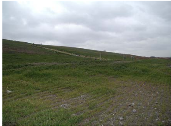
Corrective Action Territory at the Landfill in Illinois.

"We keep spare pumps, motors and parts which we can replace ourselves, such as exhaust valves, filters and the like, on hand at all times. When something major occurs, such as problems with the seals or air cylinders, we have a repair plan that we developed with Blackhawk," Brooks continued. "The problem pumps are picked up right away and they call the next day with an answer. They are returned within a week. Blackhawk jumps on the problem right away. The turnaround is fast. When the pumps come back, they have been completely disassembled and redone. They're like brand new. I like working with Blackhawk and have for years. They are efficient, easy to work with, and a no-nonsense company."