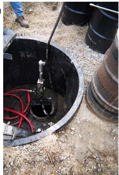
Blackhawk Pneumatic Pump is relatively maintenance-free even after pumping tar pitch at oil refinery site.

The company is headquartered in Glen Ellyn, Ill.