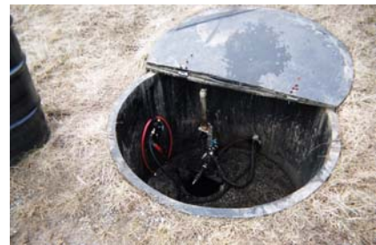
Blackhawk Pneumatic Anchor Pump pumping tar pitch.

In most instances, thick, viscous coal tar is a stinking mess to recover from groundwater. This is not the case for a major Midwest tar manufacturer. At the company's Ohio manufacturing facility, Blackhawk Pumps® have assisted in removing the major clog in the works that coal tar poses to groundwater remediation efforts.