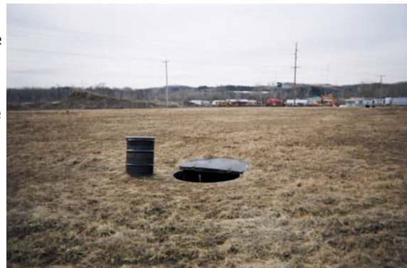
Tar refinery site in Ohio where Blackhawk Pneumatic Pumps are pumping tar pitch.

“August Mack installed two of Blackhawk’s Pneumatic Pumps® on-site nearly a year ago; the pumps have worked great pumping tar pitch and proved to be relatively maintenance free ever since. They sure are easy to install and take care of. Our custom-designed control panel lets us control the cycle of pumping. The pumps are cycled every 30 minutes — 25 on, five off, for eight hours every week,” said Glaze. “Any questions we have, Blackhawk responds promptly.”