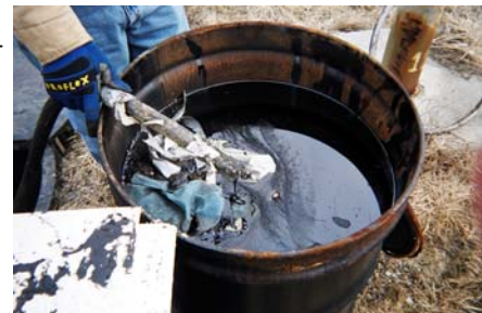
Thick, viscous tar that has been removed from groundwater at tar manufacturing company.

Since 1995, August Mack Environmental Consultants, Columbus, Ohio, has handled the corrective actions for the remediation project at this Ohio facility, from conceptual design to implementation to maintenance. August Mack provides a full range of environmental and health and safety services to clients nationwide. Their highly qualified and trained staff works with clients, from inception to completion of a project, to assure that environmental concerns have been fully addressed.